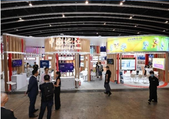
*Booth Design for Reference Only